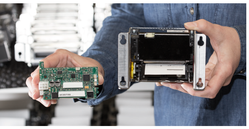
Alternative to built-in printers: separation of control unit and mechanics

With the GeBE-Chipset you first get a list of components (BOM), which we propose for the layout of your control unit. Secondly our experts will give a recommendation for the schematic design of your board for an optimal control of the printer. The heart of all is our µProcessor, which is equipped with GeBE printer firmware. You can update the firmware and fonts at any time. A compatibility with the recommended components is ensured.