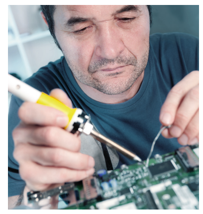
Integrate the print control in your central control unit

A consistend high print quality will only be achieved if during the printing process, for example, the power supply or voltage is dynamically balanced or temperature differences are regulated.