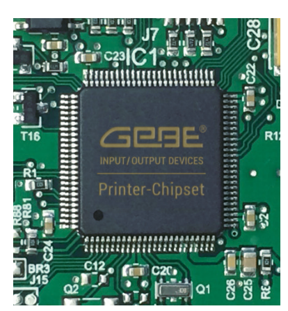
Saves development- and component-costs: a thermal printer and the GeBE-Chipset