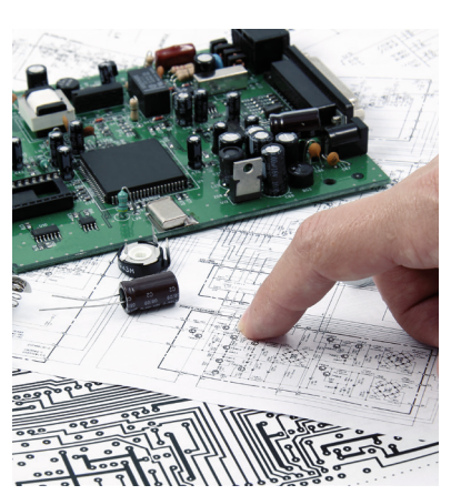
Saves engineering- and head-work: construction of the control board with expert know-how